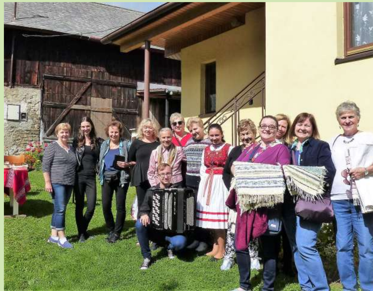
Visiting a weaver's traditional house.