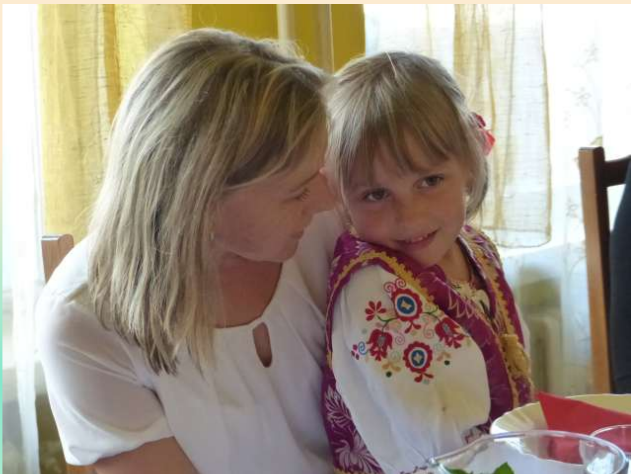
MY MOTHER'S COUSINS IN LIPANY